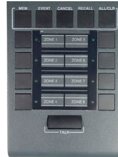
Illustration 2: Controls