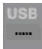
Illustration 6: USB Port

The equipment has an input for peripheral power supply. The emergency power line is continuous and has a nominal value of 5V to be supplied externally to the equipment with a USB charger provided with the equipment. MiniUSB female connectors.