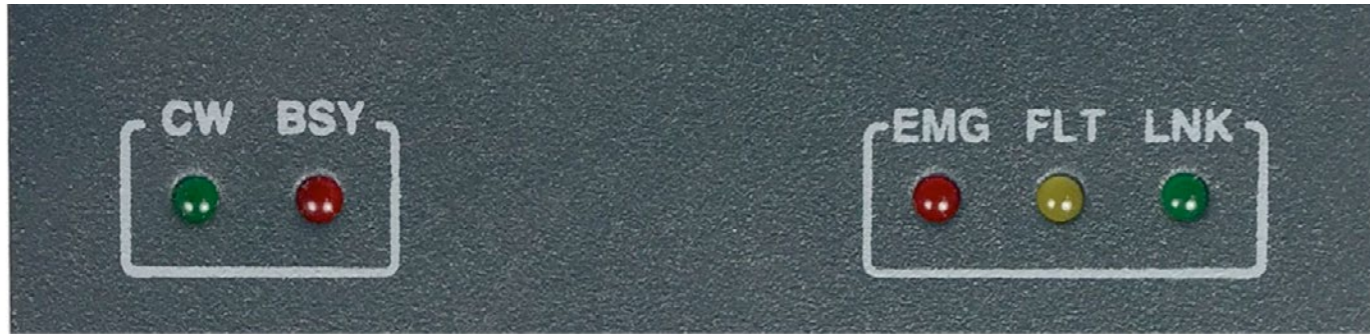
Illustration 1: Front indicators