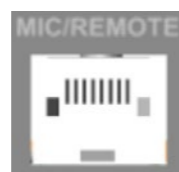
Illustration 5: ACSI Bus Input