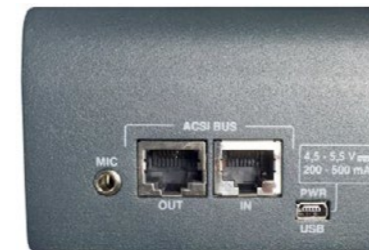
Illustration 3: Entradas y Salidas