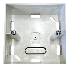
MODULE SAILLIE BA : Surface mounting box (optional)