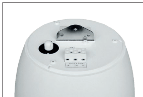
Connector and hook system