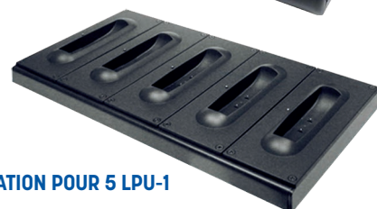
STATION POUR 5 LPU-1