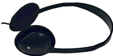
Ref. CASQUE LÉGER