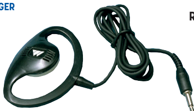
Ref. OREILLETTE CONTOUR