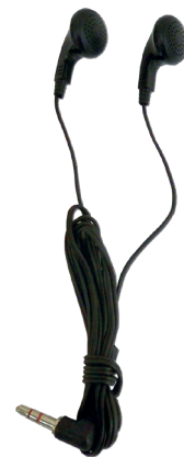
Ref. ECOUTEURS JETABLES