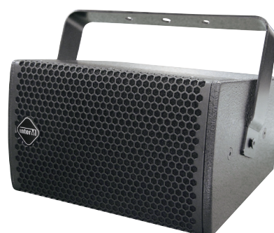
MSB-80 : U bracket (optional)