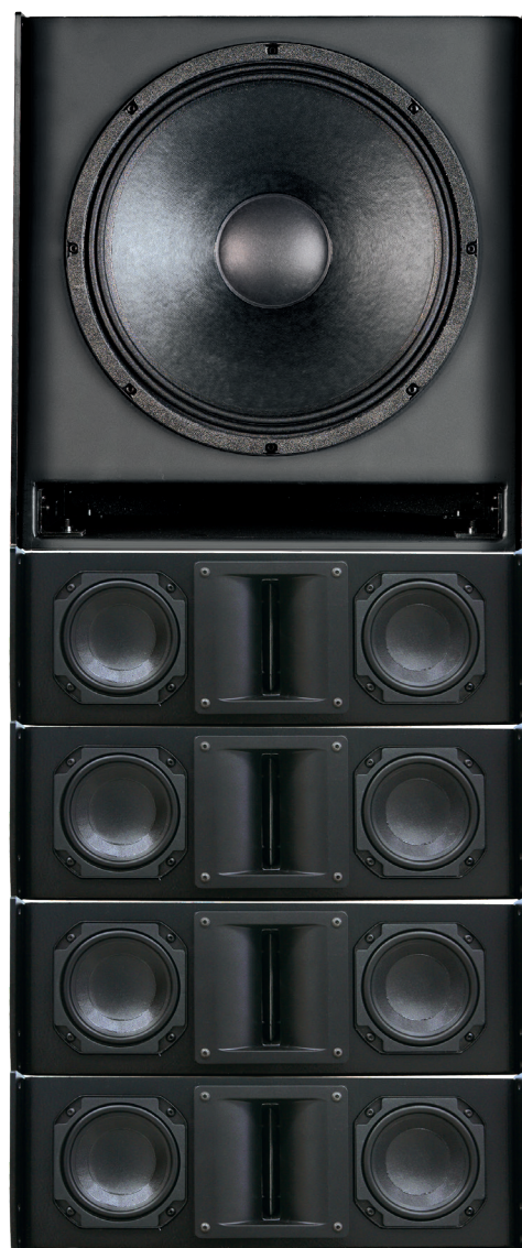
Cluster with 1 NLA-15S et 4 NLA-5