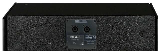
NLA-5 rear panel