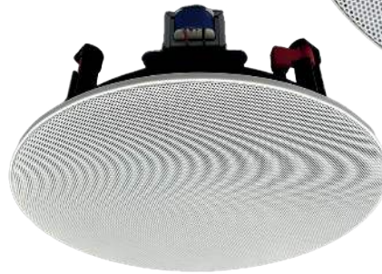
Bandwidth and impedance