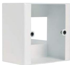
BOITIER VC S: On-wall mounting