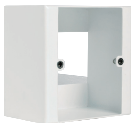
BOITIER VC S: On-wall mounting